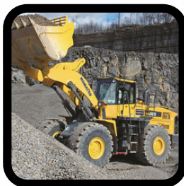
Wheel Loader Wheels