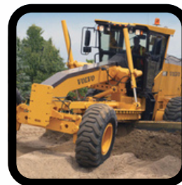
Motor Grader Wheels