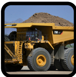
Mining Truck Wheels