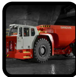
Underground Mining Wheels