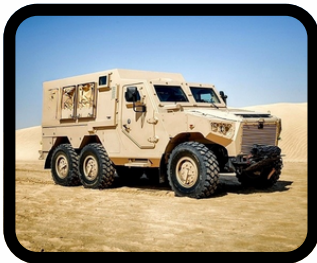
Armoured Personnel Carrier Wheels